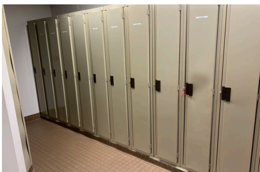
Current facilities do not offer adequate locker room space, including gender-equitable amenities.