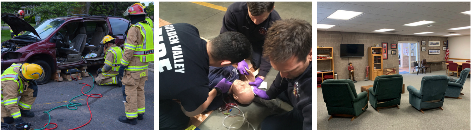
Lack of adequate training space means most training occurs on concrete and outdoors, which is not ideal in winter.

The transition to duty crew staffing will ensure long-term resiliency of the fire department and its operations. It will require facilities that support 24/7 operations, including on-site training, a kitchen and day room, bunk rooms, physical fitness/workout facilities, and shower/changing/locker rooms. None of Golden Valley's three stations have the physical capacity in site size or building construction to meet these functional needs.